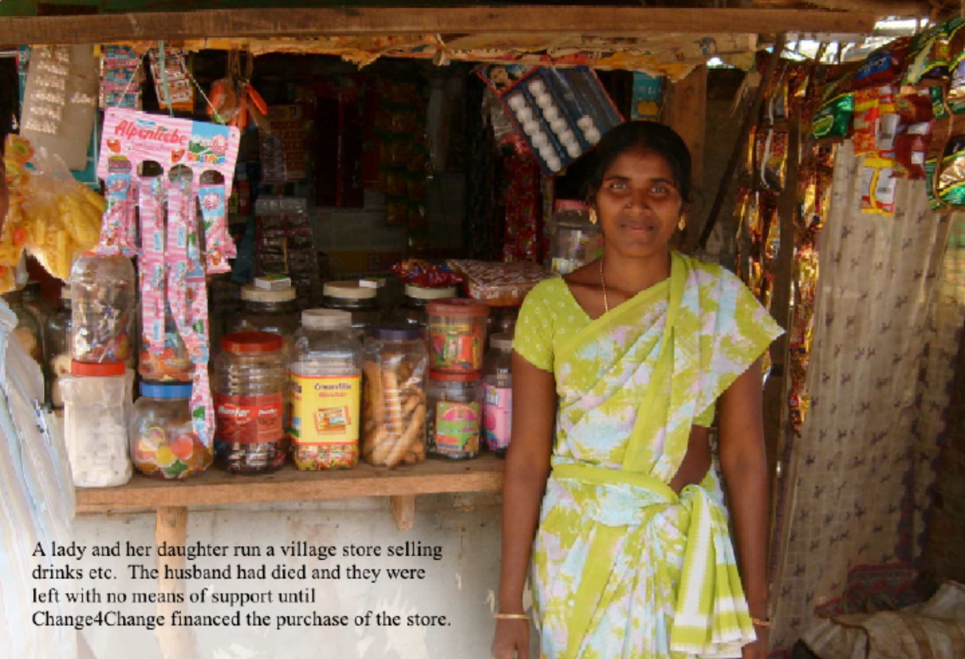
A lady and her daughter run a village store selling drinks etc. The husband had died and they were left with no means of support until Change4Change financed the purchase of the store.